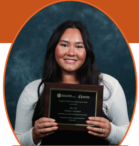
AVA VO Warren County 2024 Overall Winner Springboro High School