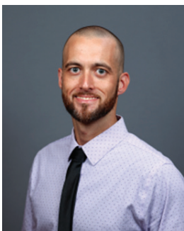
Jared Kaiser Wellness Center