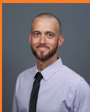
Jared Kaiser Wellness Center Deerfield Campus